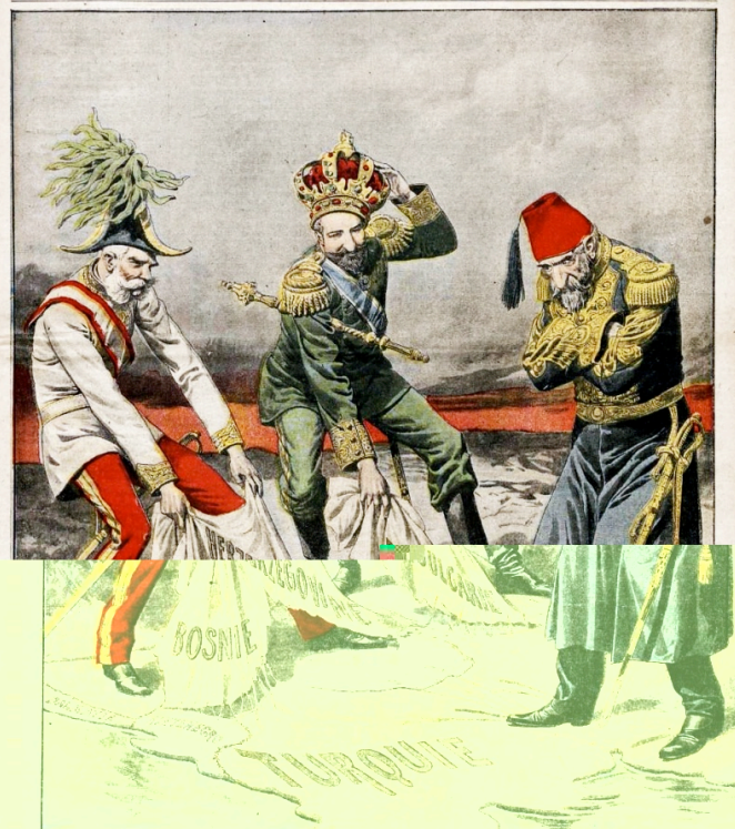
LE REVEIL DE LA QUESTION D'ORIENT La Bulgarie proclame son indépendance. — L'Autriche prend la Bosnie et l'Herzégovine