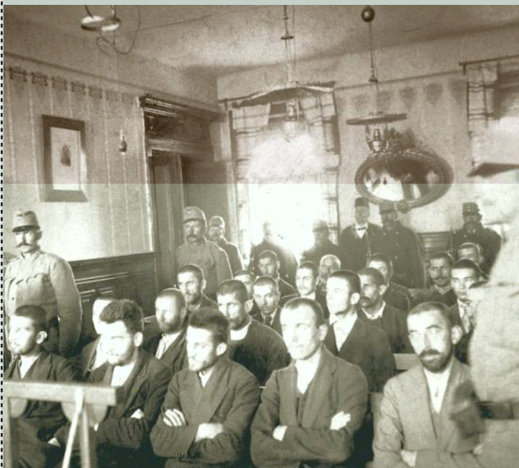
Sarajevo Museum, Sarajevo during the Austro-Hungarian Monarchy 1914-1918